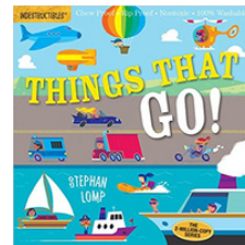
Things that Go! By Amy Pixton