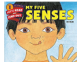
My Five Senses By Alik